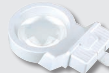
192102 Head MODULAR 16 D / Ø 60 mm