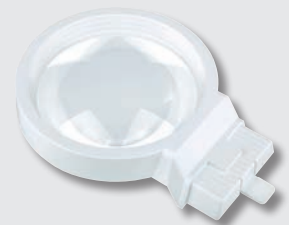
195102 Head MODULAR 6 D / Ø 100 mm

Items can be ordered with or without the necessary batteries as per price list.