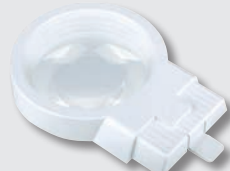
193102 Head MODULAR 12 D / Ø 70 mm