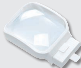
196102 Head MODULAR 8 D / 100x75 mm