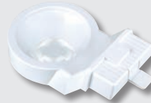
190102 Head MODULAR 28 D / Ø 35 mm

Easily interchangeable battery operated basic unit (handle with fixed tilting part). Tilting part can be swivelled for right or left-handed use