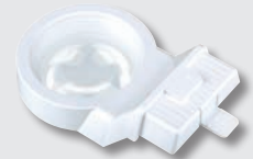
191102 Head MODULAR 20 D / Ø 55 mm