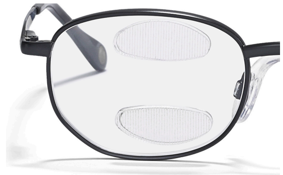
ML Peli Prism PeliSeg double