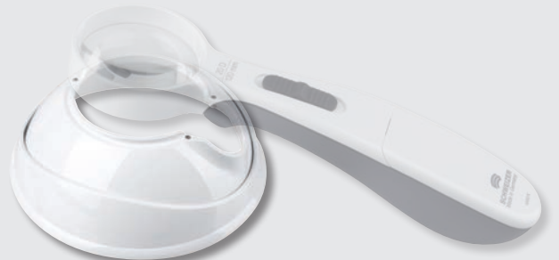
175102 ERGO-Base for ERGO-Lux MP 20 D