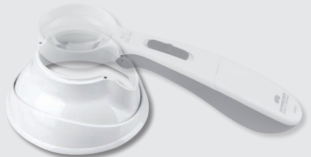
176102 ERGO-Base for ERGO-Lux MP 16 D