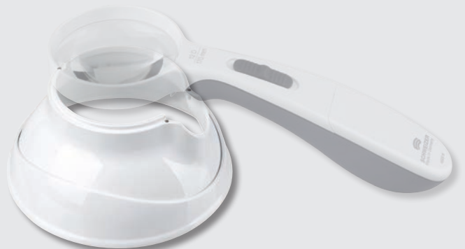
177102 ERGO-Base for ERGO-Lux MP 12 D