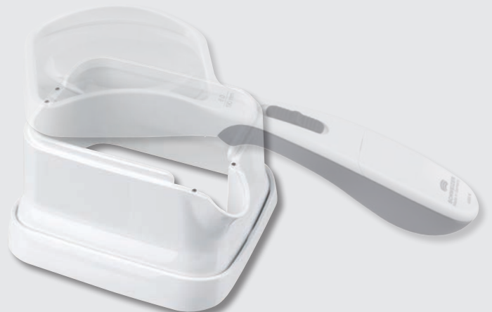
178102 ERGO-Base for ERGO-Lux MP 8 D